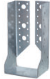
Special non-standard widths available to order.

For use in heavy duty applications such as multiple truss units, main trimmer joists, purlin to beam connections or similar situations where unusually heavy loads occur. Manufactured from 2mm thick galvanised steel. Bolt hole to suit M12 fixing, nail holes 5mm diameter.